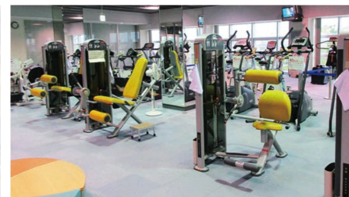
Training room Equipped with 56 machines of 26 kinds