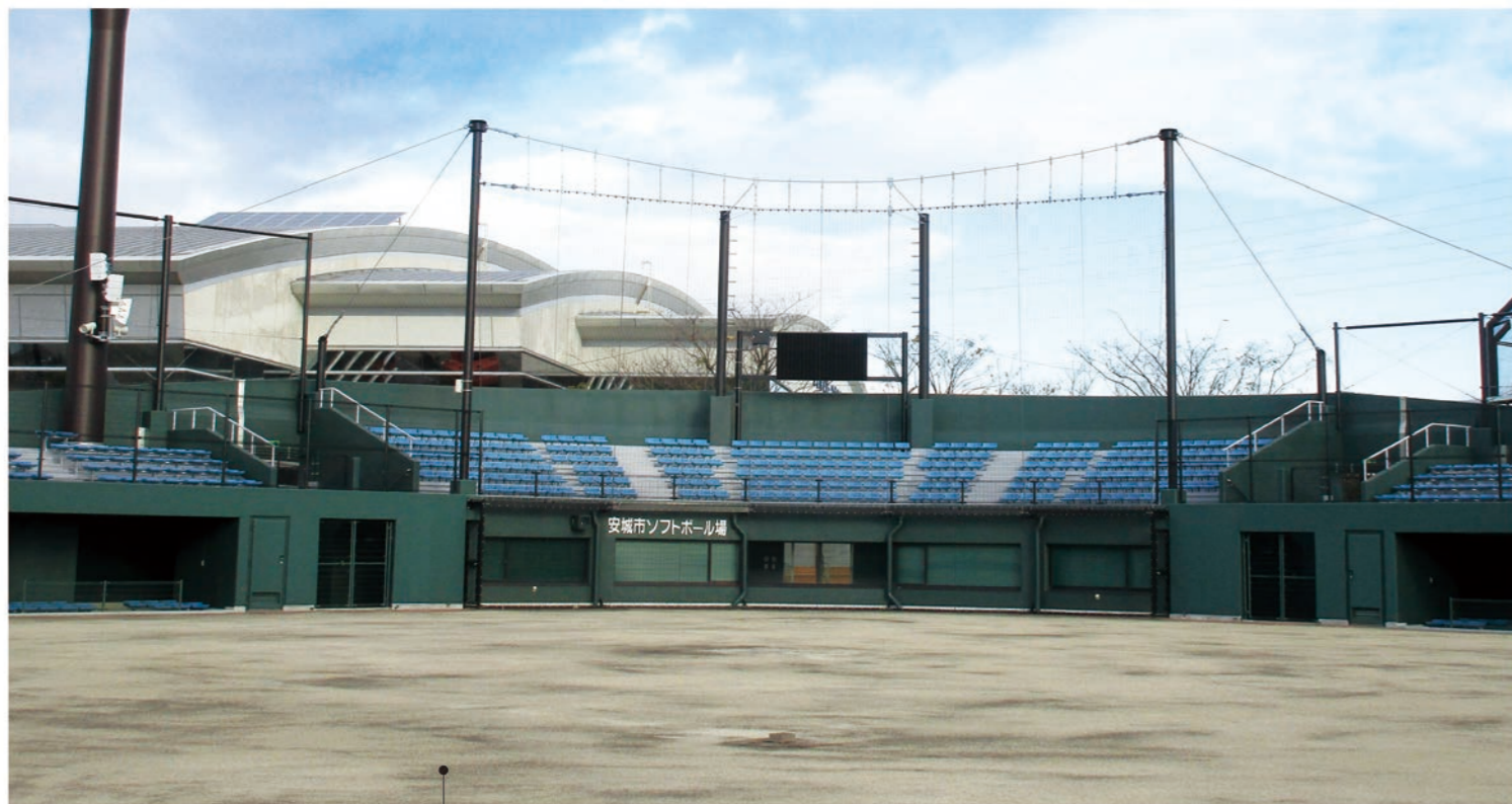
Softball Ground A Area 7,130 m 2

Standard softball field with an electric scoreboard using natural turf for the outfield Fully renovated in 2018.