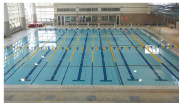
Indoor heated swimming pool 25 m x 9 courses (Officially approved for a short course pool)

1 minute on foot from the Softball grounds, 2 minutes from the Gymnasium