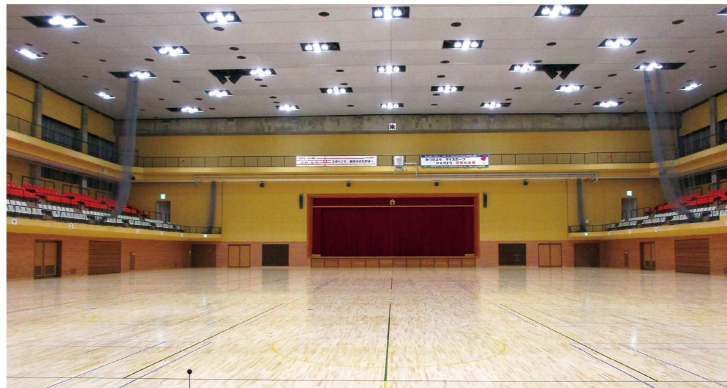
Main arena Area 1,980 m 2

This gymnasium meets the requirement of National Federation of Badminton. Fully renovated in 2018.