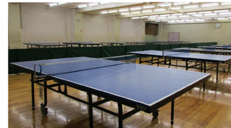
Table tennis hall • Area: 493 m 2 , 16 tables available • Fully equipped with table tennis tables and rts meet ITTF specifications