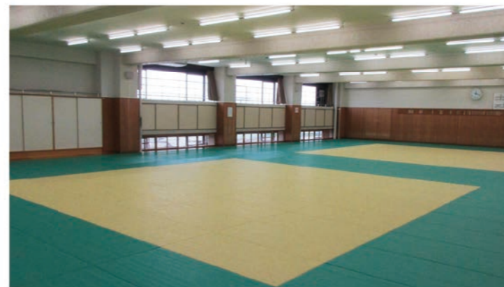
Judo hall • Area: 493 m 2 , 2 judo courts available • Permanently equipped with tatami of international standards