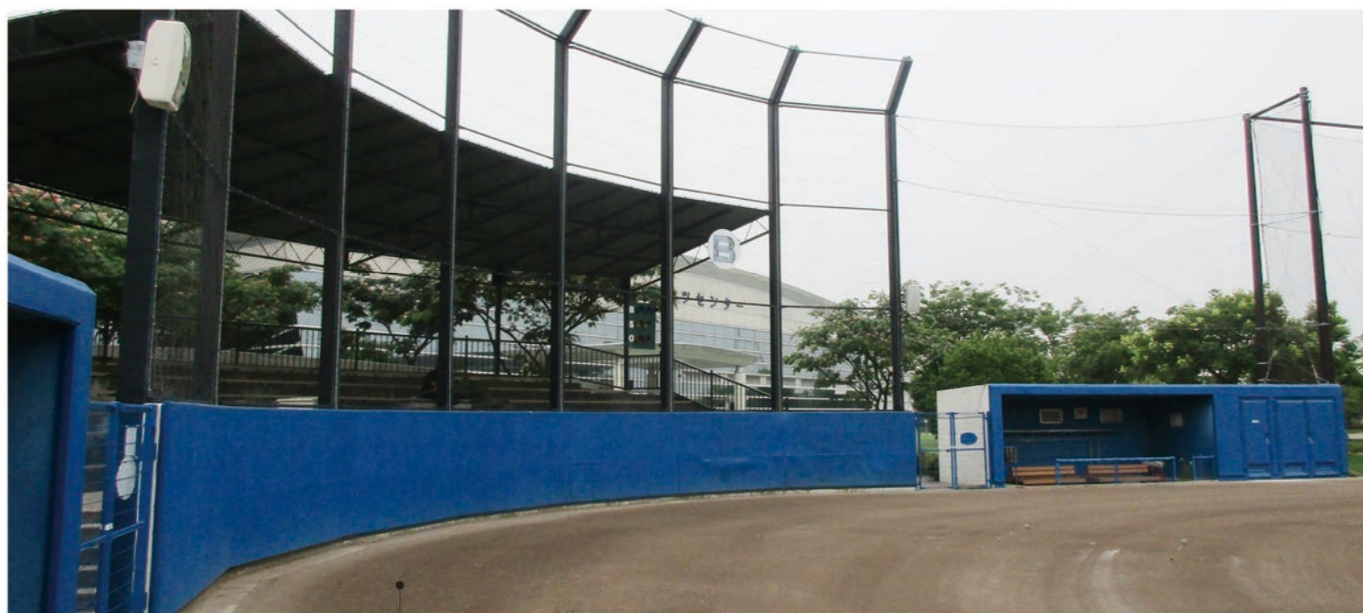
Softball Ground B Area 7,130 m 2