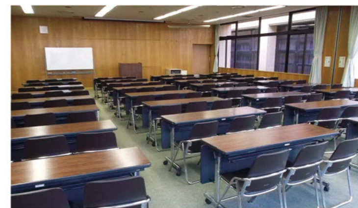
Conference room 1 (160 m 2 ), Conference room 2 (115 m 2 ) Equipped with screens and audiovisual facilities