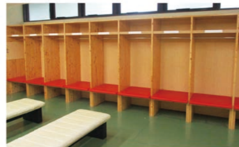
Locker room: 2 rooms each for men and women • Lockers 30 in total (15 each for men and women) • Showers 10 in total (5 each for men and women)