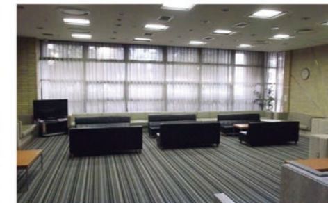
Lobby With meeting space