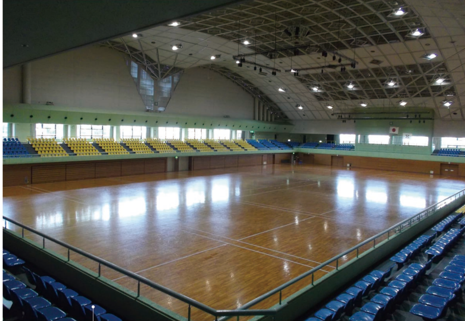
Stadium 1 Area 3,450 m 2