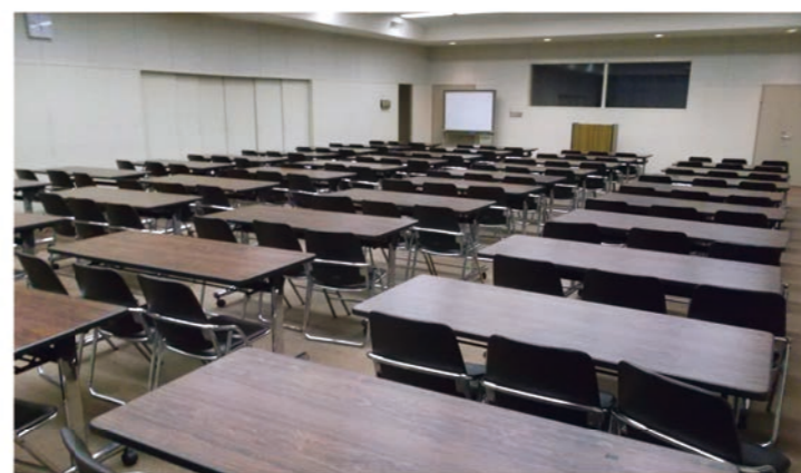
Lecture room (202 m 2 ) Equipped with screens and audiovisual facilities