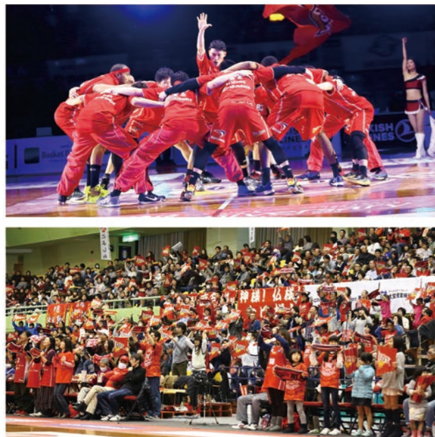
Stadium 2 Area 1,178 m 2